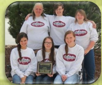
Butte High School Spirit of Envirothon Award

The team was sponsored by the Weiser River Soil Conservation District who will continue to work with the students to prepare for the North American Envirothon Competition.